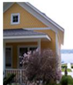
Bellevue Harbour House 419 Lake Street Downtown on the Water

www.BoutiqueInnsOfSaugatuck.com or www.Saugatuck.me