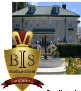
The Belvedere Inn 3656 63rd Street Mini Versailles

ASK YOUR SERVER FOR DETAILS OR VISIT US ONLINE