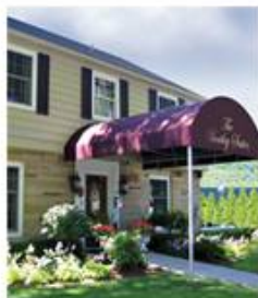
Bentley Waterfront Suites 326 Water Street Downtown on the Water